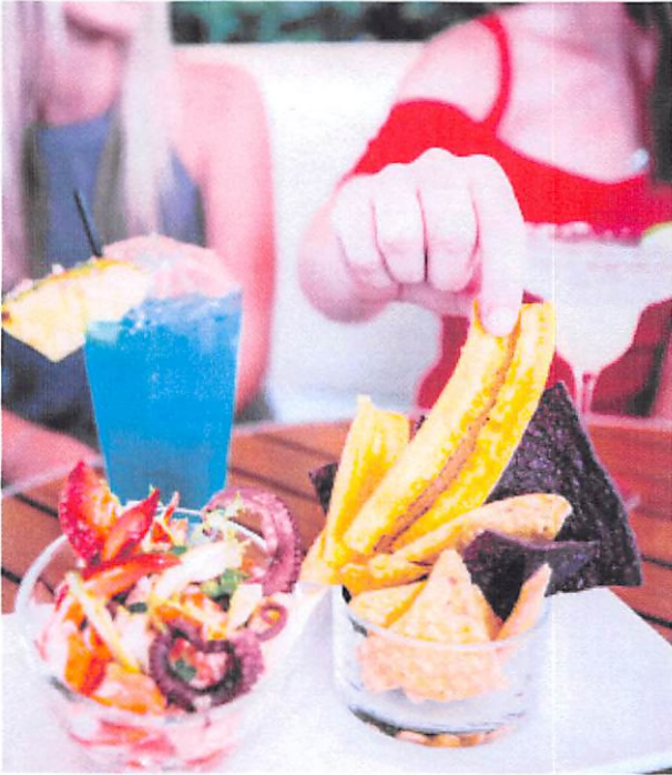
EAT & DRINK